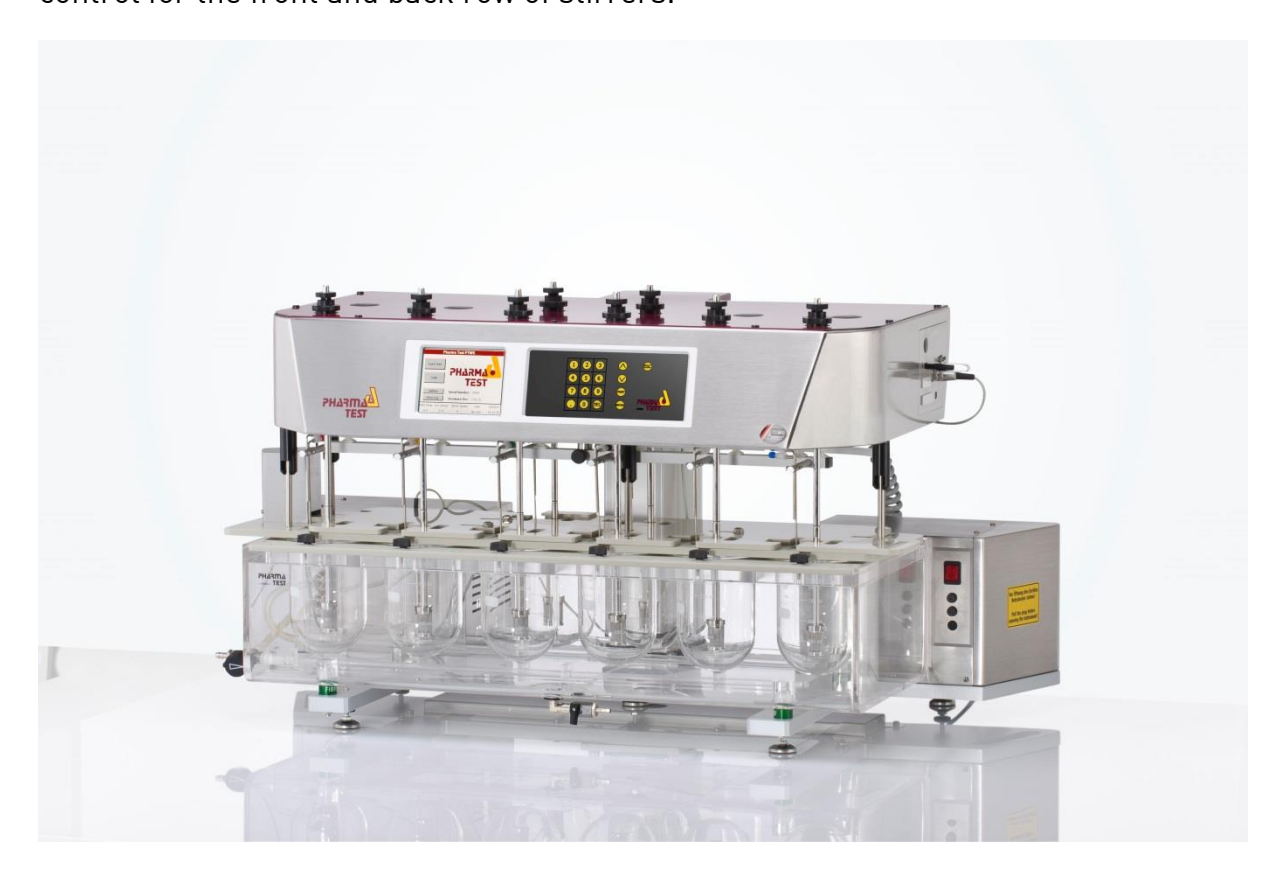
PTWS D620 USP/EP Tablet Dissolution Testing Instrument

The PTWS D620 is a "Dual Drive" 6+6 position, single drive tablet dissolution testing instrument for solid dosage forms as described in USP chapter <711/724> and EP section<2.9.3/4> as well as the DAB/BP and Japanese Pharmacopeia section <15>. The instrument features two additional vessels (approx. 250ml) for media refilling and reference standard media. PTWS D620 features independent stirrer speed control for the front and back row of stirrers.