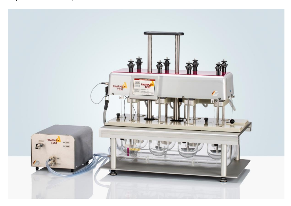
PTWS 820D 8-position Dissolution Tester

The PTWS 820D is an 8 position, single drive compact tablet dissolution testing instrument for solid dosage forms as described in USP chapter <711/724> and EP section <2.9.3/4> as well as the DAB and Japanese Pharmacopeia section <15>.