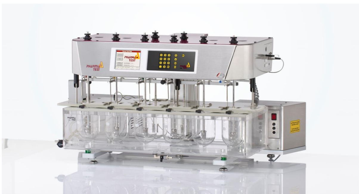
PTWS 620 6 + 2 position, single drive Dissolution Tester

The PTWS 620 is a 6 + 2 position, single drive tablet dissolution testing instrument for solid dosage forms as described in USP chapter <711/724> and EP section <2.9.3/4> as well as the DAB/BP and Japanese Pharmacopeia section <15>. The USP monograph <1092/2.4.2> lists visual observation of the dissolution behavior as essential for identifying variables in the formulation or manufacturing process. The six vessels in the front row of PTWS 620 offer optimal visibility of the samples.