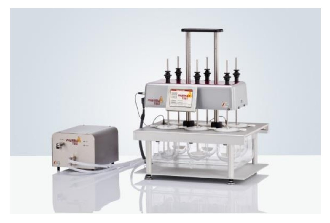
PTWS 120S 6-position Dissolution Tester

The PTWS 120S is a 6 position, multiple drive, compact tablet dissolution testing instrument for solid dosage forms as described in USP chapter <711/724> and EP section<2.9.3/4> as well as the BP, DAB and Japanese Pharmacopeia section <15>. It is designed for manual operation and ease of use.